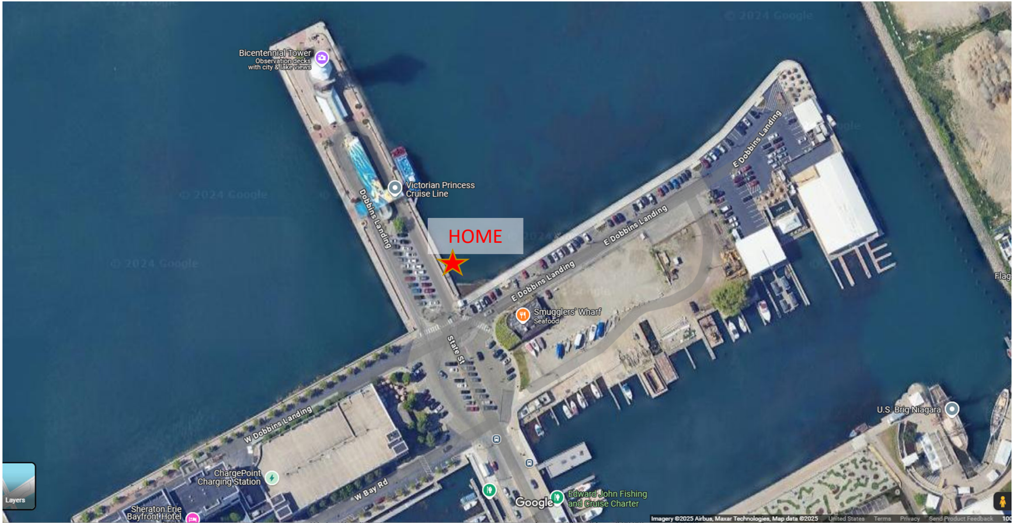
Exhibit A: Map of Docking Areas